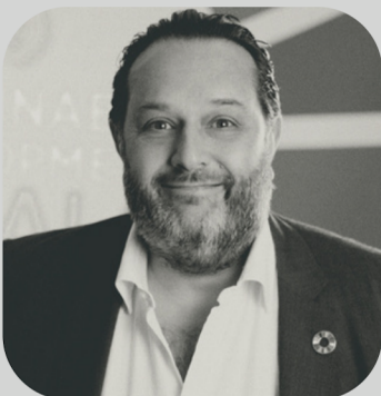
PIERRE ROUSSEAU impact & sustainable finance